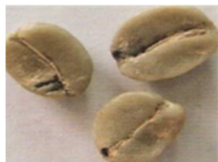
Coffee beans caused by insects that cause perforated beans and damaged beans due to post-picking or harvesting

using human senses according to the prevailing standards. The quality standard of coffee beans has been encouraged since 1978 through DECREE of the Minister of Trade No. 108/Kp/VII/78 dated 1 July 1978. The quality standard of coffee beans used is the triage system. But from October 1, 1983, until now, to determine the quality of coffee, Indonesia uses the Defects Value system following the decision of the International Coffee Organization (ICO) . In this defect system, the more the value of the defect, the lower the coffee quality, and the smaller the defect's value, the better the quality of the coffee. Coffee beans are a coffee that is ready to be traded, the form of dried coffee beans that have been detached from the fruit flesh, horns skin, and skin.