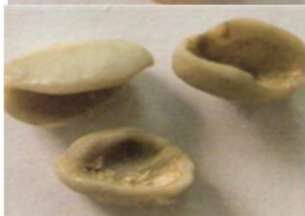
Seeds are subjected to depreciation. The cause is due to drought and less fertile beans