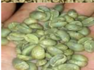
Coffee beans in good condition, do not suffer damage and uninfected with coffee bean crop pests