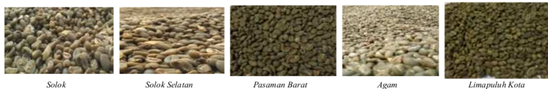
Fig. 4 Ranah Minang Coffee Beans Colors

Based on the general quality requirements shown in table 1 above, in all samples of coffee from the origin of Ranah