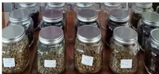
Fig. 1 West Sumatera Arabica coffee beans samples

The criteria for determining the quality of coffee beans refer to the physical test standard of Indonesian National Standard [18] and the standard of Specialty Coffee Association of America (SCAA) [19]. The physical test stages of coffee beans that are commonly done are water content test, Tracee test, defect test, color/smell test, and seed size test. The Minang Coffee Association in the Ranah Minang uses the criteria of physical quality value, water content, seed defect value, and land elevation for quality determination of coffee. Physical testing is a system used to assess the quality of coffee beans based on their physique, either using AIDS or using the human senses in accordance with the prevailing standards.