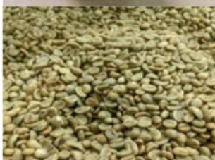
Coffee beans in good condition, do not suffer damage and uninfected with coffee bean crop pests