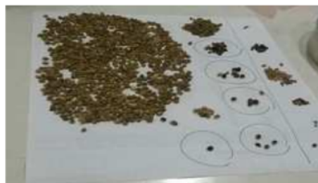
Fig. 2 Coffee Beans Quality Test

3) Defect Value : The defect is the sum of the value of coffee beans defect. Test of Defect done when coffee beans are ready to export to determine the coffee's quality or grade. To determine defect can use two systems, namely the Indonesian National Standard and standard Specialty Coffee Association of America (SCAA) [19].