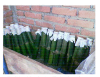
Traditional Incubation. The bamboo tube wa propped against the wall in the corner of the room, without temperature control