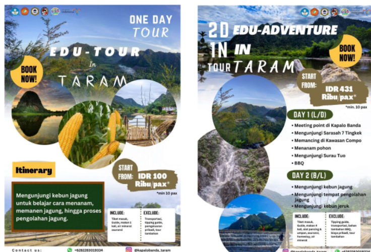
Figure 2. Brosur Promosi Paket Wisata Taram

The process of building photo booths and educational tourist destinations is still ongoing. In addition, the PIPK implementation team also contributed to the provision of tools and materials in the development. For the visitation rate to increase, the physical evidence aspect in the marketing mix is also considered. One of them is the provision of infrastructure facilities such as the construction of an entrance gate as a welcome greeting at Kapalo Banda tourist attraction and the provision of garbage disposal for visitors. Although measuring the success rate of the program is still too early to do because the construction process has not been completed, it has had a significant impact. For example, there has been an increase in the number of visitors if a comparison is taken in the month when visitors are usually busy, namely July during the school holidays. Based on this comparison, the number of visitors in July 2022 was 25,795 visitors more than in July 2021, which was 16,450 visitors.