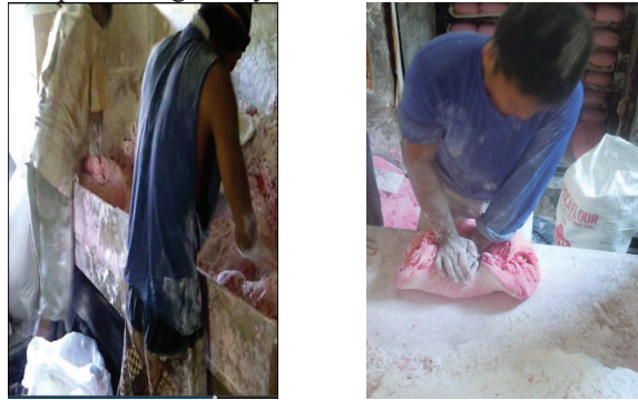
Fig. 2 Manual kneading

kerupuk merah dough difficult. Consequently, it is often difficult to hire kneaders, and thus the production capacity becomes impacted negatively.