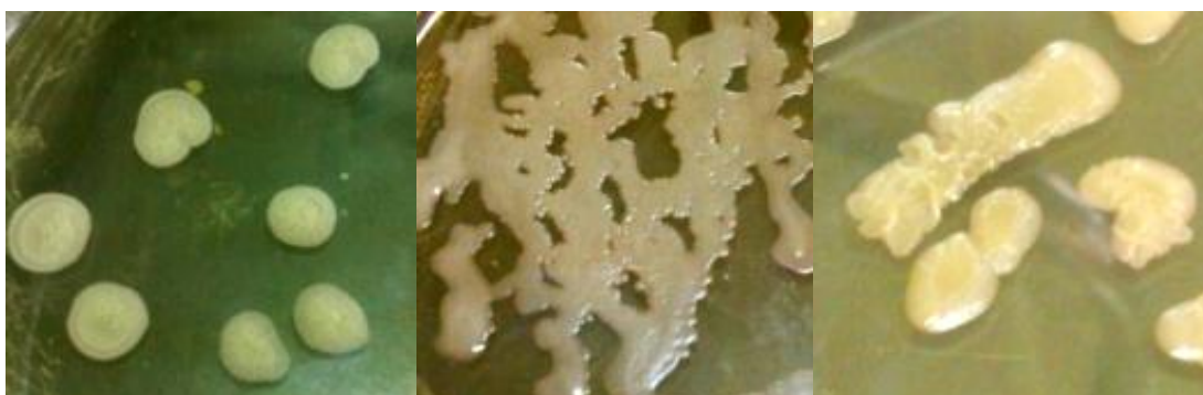
Fig. 1:- A 1 ) Azotobacter A 1 .bk isolates focused cells, intact colony edges, yellowish creamy pigment colors, the total population of 10 5 CFU / gram of soil. A 2 ) Azotobacter isolates A 2 .bb.p, Yarn-shaped cells, wavy edge colonies, white pigment colors, total population 4 × 10 4 CFU / gram of soil, A 3 ) Azotobacter isolates A 3 .tt.k., irregularly shaped cells, the edge of toothed colonies, yellowish beige pigment color, total population 5 × 10 4 CFU / gram soil.

Azotobacter indigenous isolates derived from rice plants rhizosphere with the SRI method in the farmers' rice fields in Harau District, Limapuluh Kota Regency. The results of the previous trial selection, obtained three types of indigenous Azotobacter isolates with good potential (number of cells > 10 5 × 10 4 cells / mL) are A 1 .bk, A 2 .bb.p, and A 3 .tt.k, conducted with potential Azotobacter indigenous species test source of inoculum in rice plants SRI method (Fig. 1).