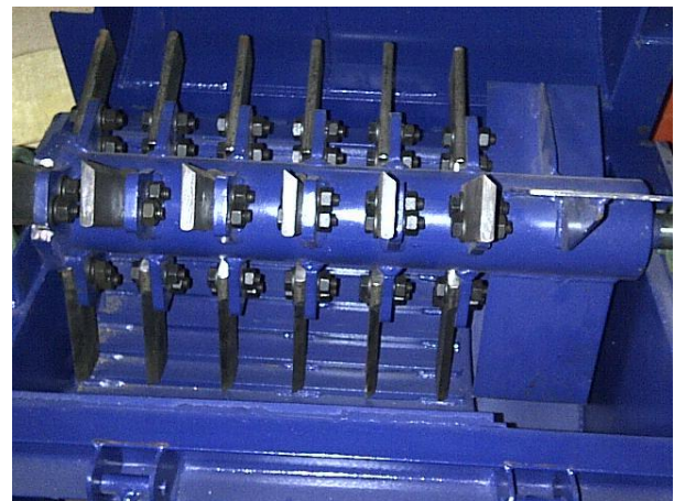
Fig. 1. Crusher machine for grinding organic fertilizer A: complete machine B: rollers component