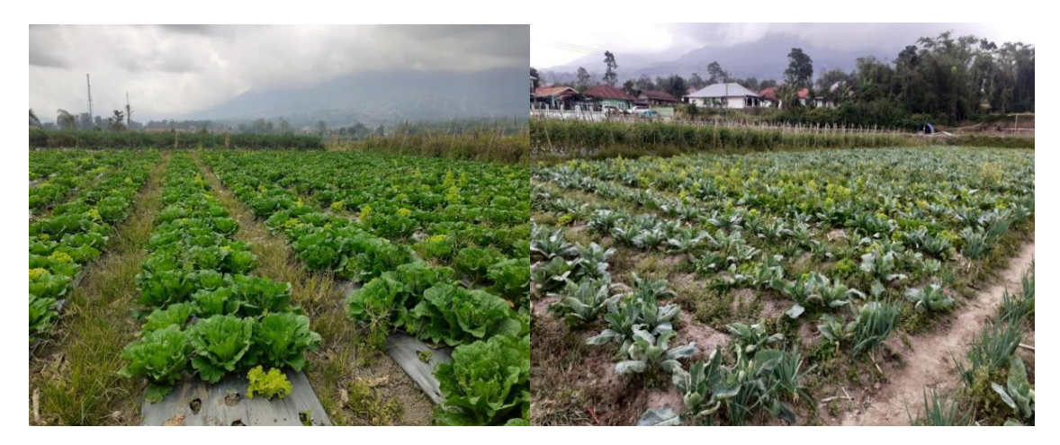
Fig. 1. Field condition of locations

The presence of E. pulchrum in cabbage plants of Batu Palano was cased by several factors, the host presence, fecundity of E. pulchrum and environmental [6,8]. E. pulchrum was oligophages for brassicaceae plants so it could be found in cabbage plants in Batu Palano [13]. Place and source of nutrition presence caused E. pulchrum presence was not difficult to find in Batu Palano even though in small number.