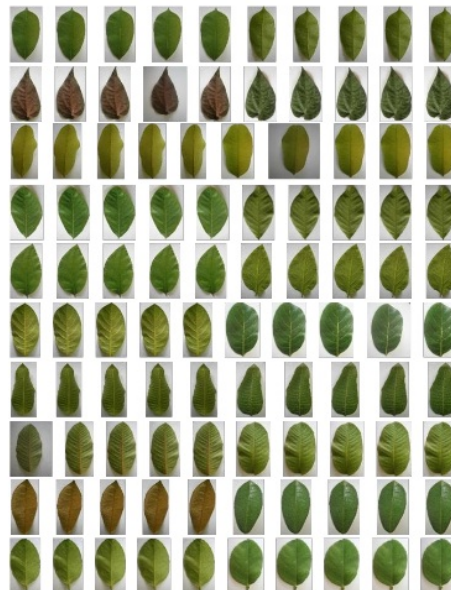
Figure 2. Leaf images